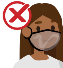
Hard to breathe fabrics

Thank you for protecting our patients and staff!