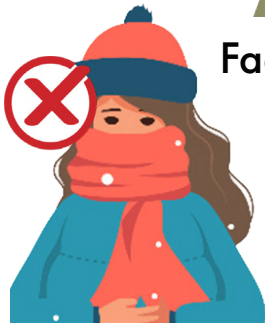
Winter clothing being used as a face covering